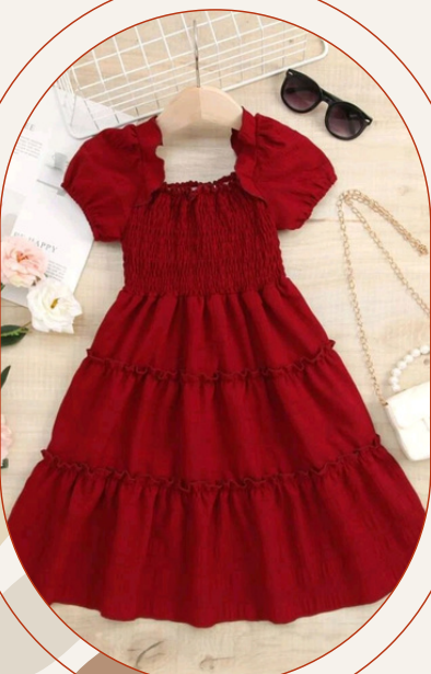
Girls Shirred Puff Sleeve Ruffle Hem Dress

Dark red ruffle dress add cardigan & tights to make it winter friendly Size 6