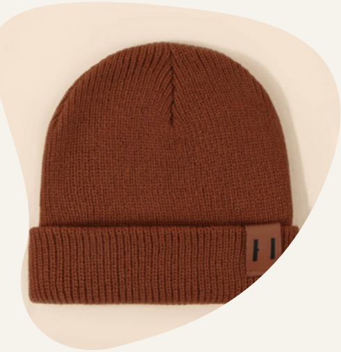
Lighter Brown Beanie