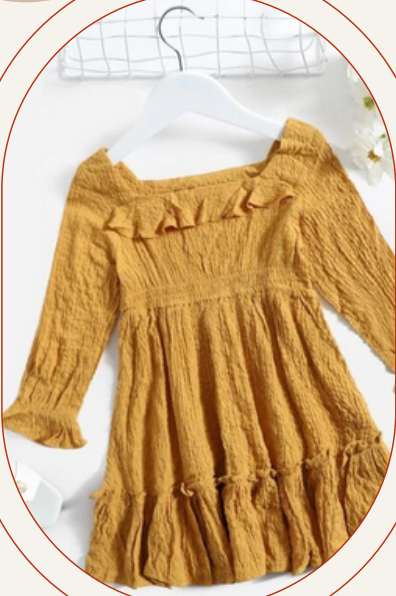
Girls square neck Flounce sleeve Ruffle Hem Dress

Mustard long sleeve dress, add tights and cardigan to make winter friendly Size 1-2