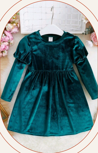
Girls Gigot Sleeve Velvet Dress