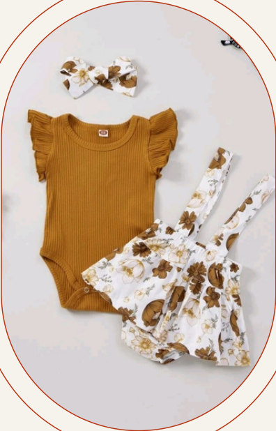
Girl Ruffle Bodysuit & Floral Skorts

Mustard long sleeve dress, add tights and cardigan to make winter friendly Size 1-2