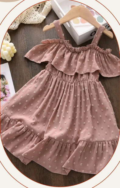
Girls Swiss Dot Cold Shoulder Ruffle Hem Dress

More of a summer dress but can add tights, long sleeve tee under it & a cardigan to make it winter friendly Size -6- (small size 7)