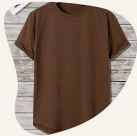
Chocolate Brown Shirt Men Curved Hem Tee