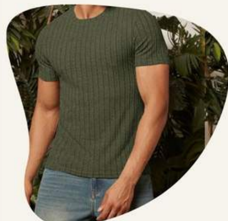
Green Ribbed Knit Shirt Mens green shirt x 2