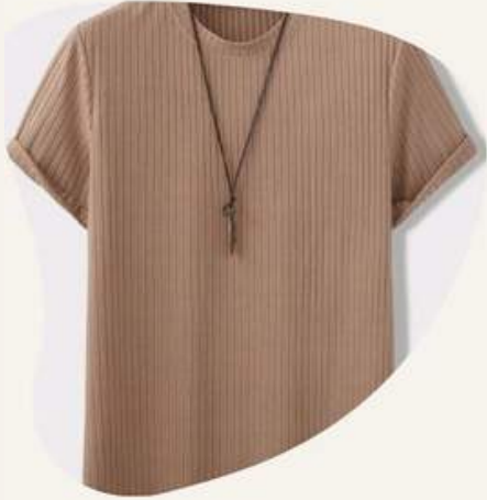
Khaki Shirt Men Solid Ribbed Knit Tee