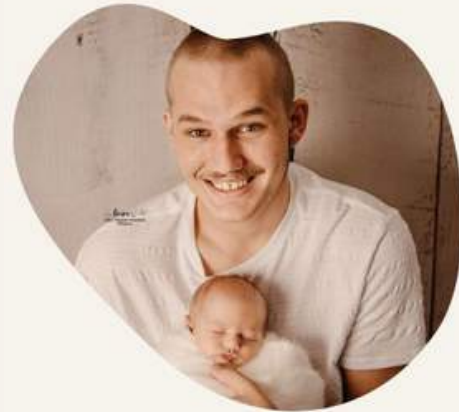
White Shirt Mens plain white shirt x 2